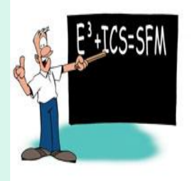
Sound financial management: economy, efficiency and effectiveness