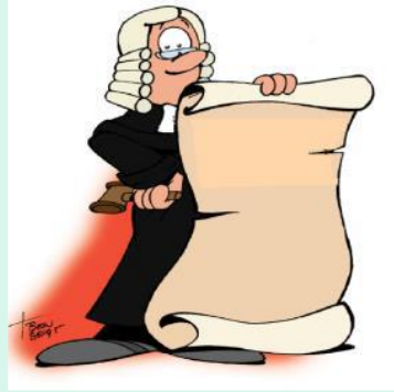
Equal treatment and non- discrimination